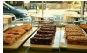
Bars Bakery: The Tour