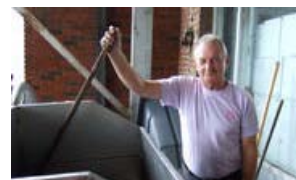
Trout Brook Vineyard Wine Mob: The wine process in pics