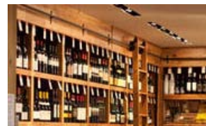
Surdyk's Flights: The Tour